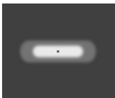
[T1] Type I