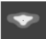
[T2] Type II