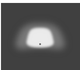
[T-ASYM-C] Tunnel, Asymmetric, Type C