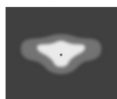
[T2] Type II