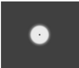
[S] Spot - NEMA Type 0