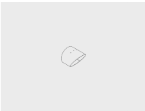
Visor for PUNTO S