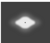
[T-SYM-A] Tunnel, Symmetric, Type A