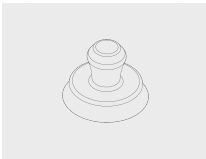
Case removing vacuum