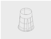
Plastic case for ZEROX M