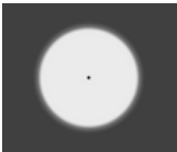
[M] Medium - NEMA Type 4