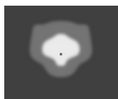
[T4] Type IV