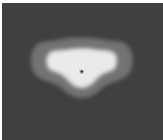
[T3] Type III