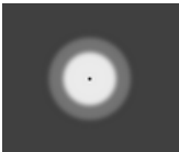
[T5] Type V