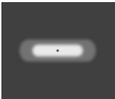
[T1] Type I