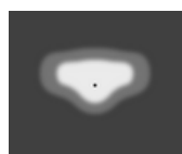
[T3] Type III