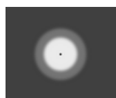
[T5] Type V