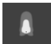
[SLFB] Special linear, Forward throw