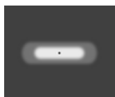
[T1] Type I