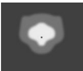
[T4] Type IV